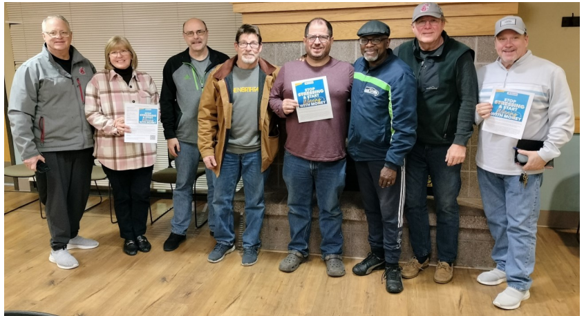
Volunteers for the 2024 Financial Literacy winter session recently gathered in preparation for the upcoming program!

The course utilizes Dave Ramsey's Financial Peace University materials and group discussion. The topics include wisdom and common sense to help sharpen skills in budgeting, paying off debt, increasing savings for emergencies, home ownership, and education expenses. Each family will receive a workbook with financial planning software for post-course planning.